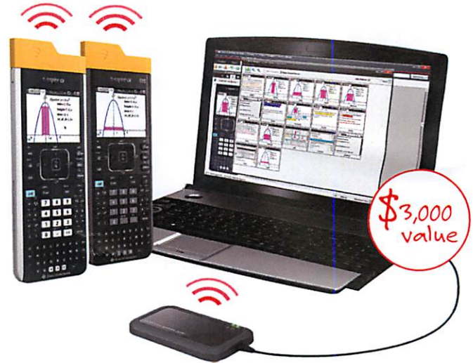
TI-Nspire™ CX Navigator™ System (Computer not included)

TI offers a special promotion for math and science educators that will help you equip your math or science classroom with the TI-Nspire CX Navigator System.