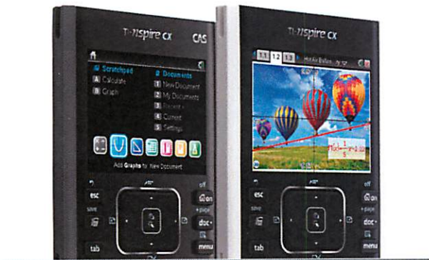
TI-Nspire™ CX CAS handheld